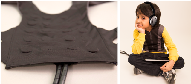
Figure 1: Vest with 20 embedded actuators and story-listening setup

Haptic patterns were presented by means of a custom-made child-size vest with flexible back fabric and open sides, capable of adjustment to allow maximum back contact for a range of chest and waist sizes. A 4 (row) \times 5 (column) array of twenty vibrotactile actuators, or tactors (type C-2, Engineering Acoustics INC., Florida, USA) were sewn into small pockets on the inside of the vest, directly in contact with the child’s back. Tactor actuation was achieved via an original iPad Mini application and Wi-Fi communication. The children wore BOSE noise-cancelling headphones to listen to the story and mask motor noises produced by the tactors.